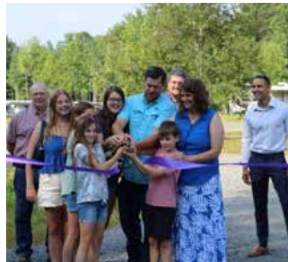
RIBBON CUTTING AT YADKIN VALLEY RV RESORT IN YADKINVILLE