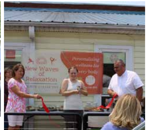
RIBBON CUTTING AT NEW WAVES OF RELAXATION IN YADKINVILLE