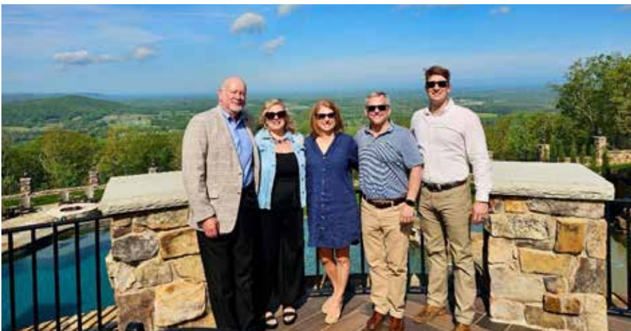
NC GOVERNOR JOSH STEIN AND FIRST LAST RECENTLY MET WITH TOURISM DIRECTORS FROM VISIT WILKES, MOUNT AIRY, AND YADKIN COUNTY AT DYNAMIS ESTATE WINES TO DISCUSS TOURISM EFFORTS IN THE REGION