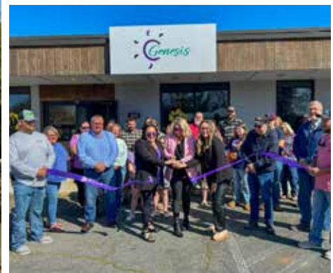
RIBBON CUTTING AT GENESIS TANNING & ESTHETICS IN EAST BEND YADKINVILLE