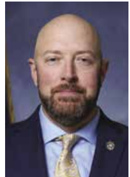
Nick Smitherman SHERIFF

Our Criminal Investigations Division, working alongside patrol deputies, recovered stolen property throughout the year, including vehicles, recreational vehicles, firearms, and jewelry. The total estimated value of recovered property exceeded $172,000. These recoveries represent not only the return of valuable possessions but also the restoration of peace of mind to victims of theft.