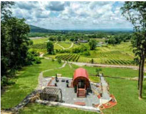
EXPERIENCE MEMORABLE STAYS AT CHATEAU JOURDAIN, SWAN CREEK ROAD

The YC-TDA continues to showcase Yadkin County through a variety of efforts, including print and digital marketing, social media outreach, newsletters and itineraries, tourism websites, brochures, travel shows, original content, and partnerships with travel bloggers. Visitors to Yadkin County can enjoy award-winning wineries, outdoor adventures such as hiking, biking, and fishing, as well as festivals, rodeo events, historic landmarks, and our vibrant farmers' market. Nestled in the heart of the Yadkin Valley wine region and framed by the Blue Ridge foothills, the county offers a true small-town charm with big experiences. With a wide range of lodging options, whether Airbnb and VRBO rentals, cozy bed & breakfasts, hotels and motels, RV parks, or rustic cabins, guests are sure to find the perfect place to enhance their stay.