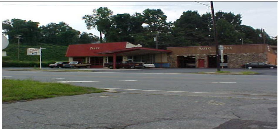
MA 16 AUTO CENTER