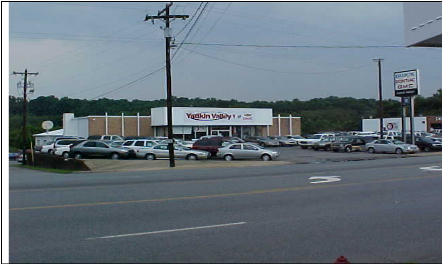
MA 53 AUTO DEALERSHIP