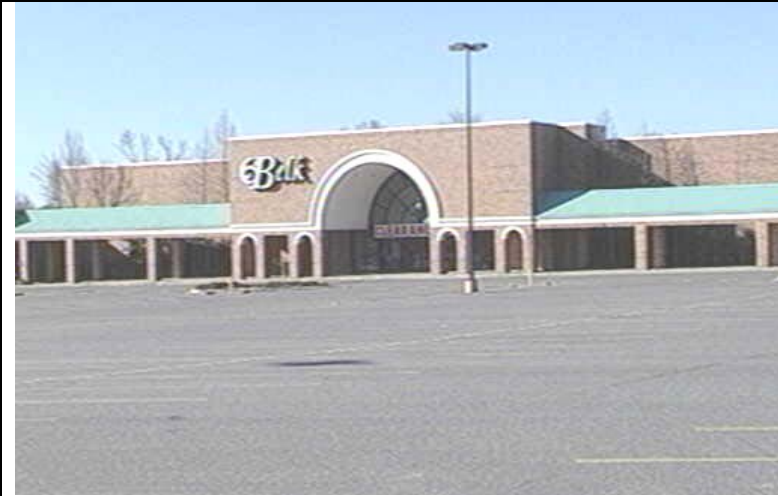
MA 35 DEPART. STORE