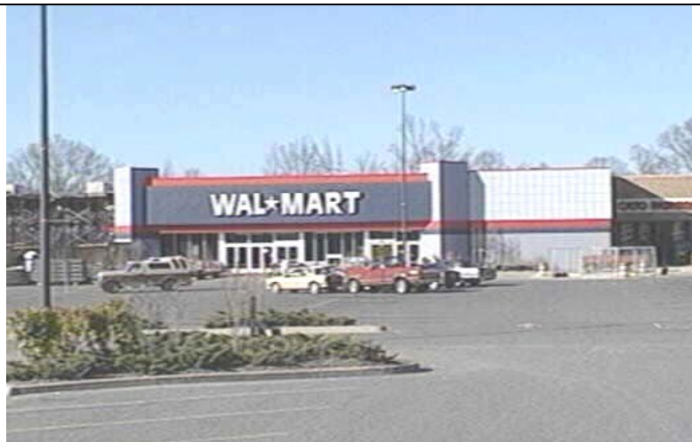
MA 34 DISCOUNT STORE