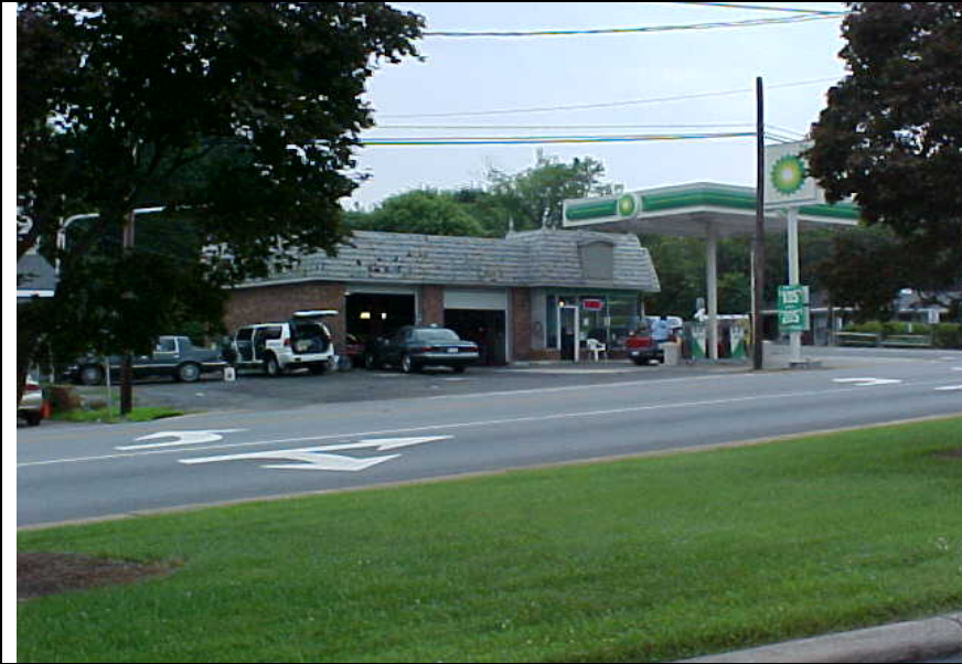
MA 15 SERVICE STATION