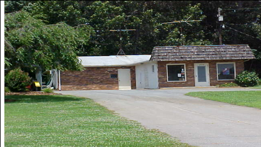
MA 41 SERVICE SHOP