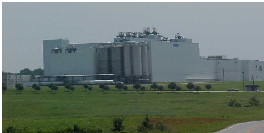
MA 37 MANUFACT. HEAVY