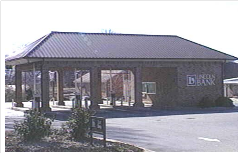
MA 64 DRIVE-THRU BANK