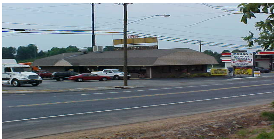
MA 12 RESTAU- RANT