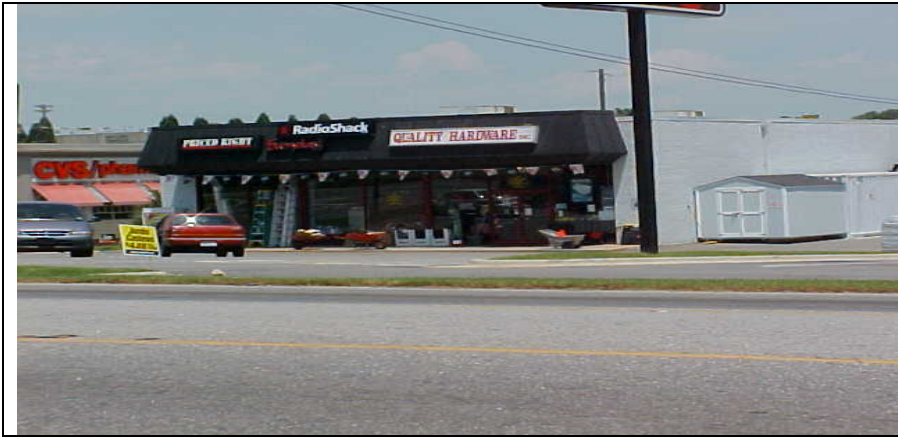
MA 07 RETAIL