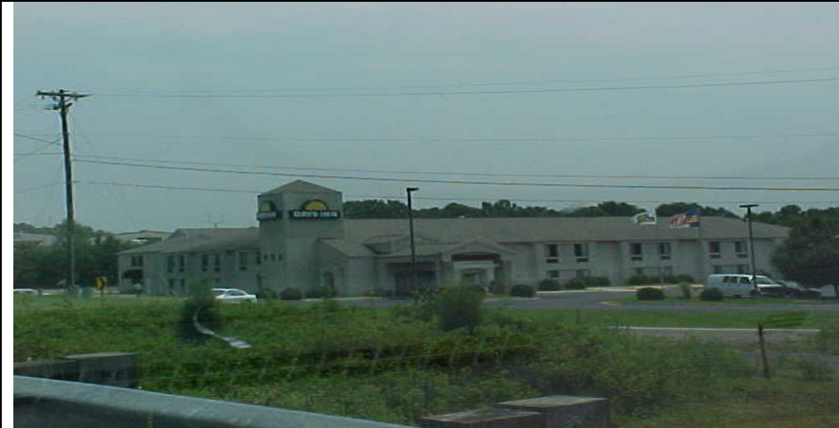
MA 21 MOTEL