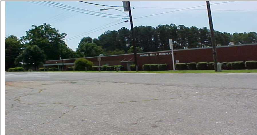
MA 22 MANUFACT. LIGHT