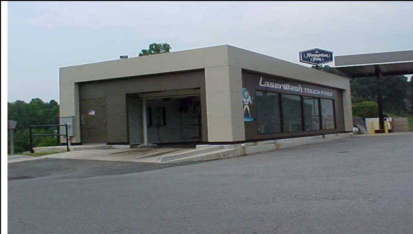
MA 33 CAR WASH (AUTO.)