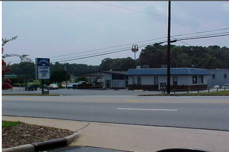
MA 64 LAUNDRY/ CLEANERS