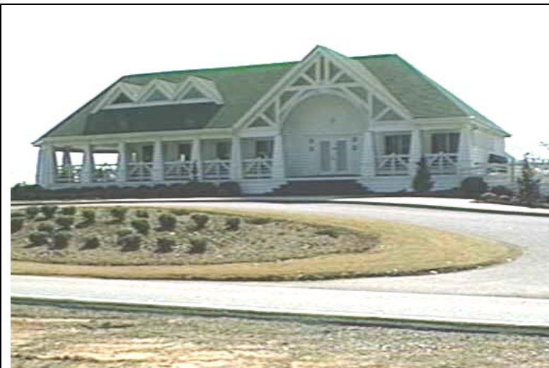
MA 26 COUNTRY CLUB