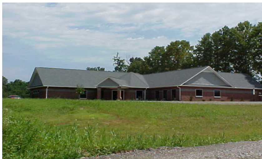
MA 73 VET. CLINIC