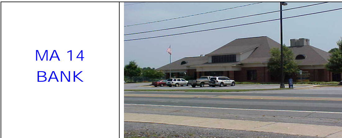
MA 14 BANK