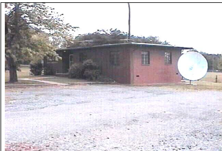
MA 66 RADIO/TV STATION