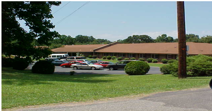
MA 11 NURSING/ RETIREMENT HOME