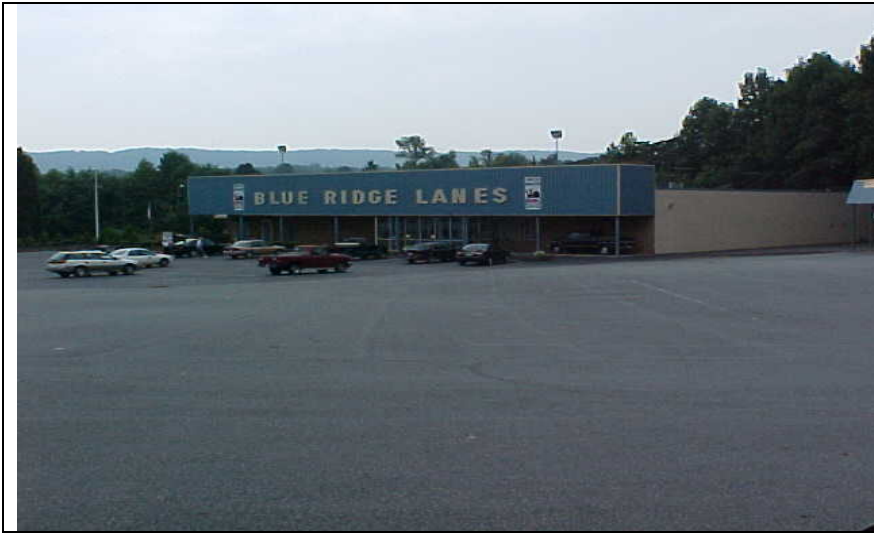
MA 19 BOWLING ALLEY