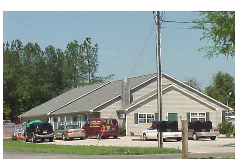
MA 17 DAY CARE