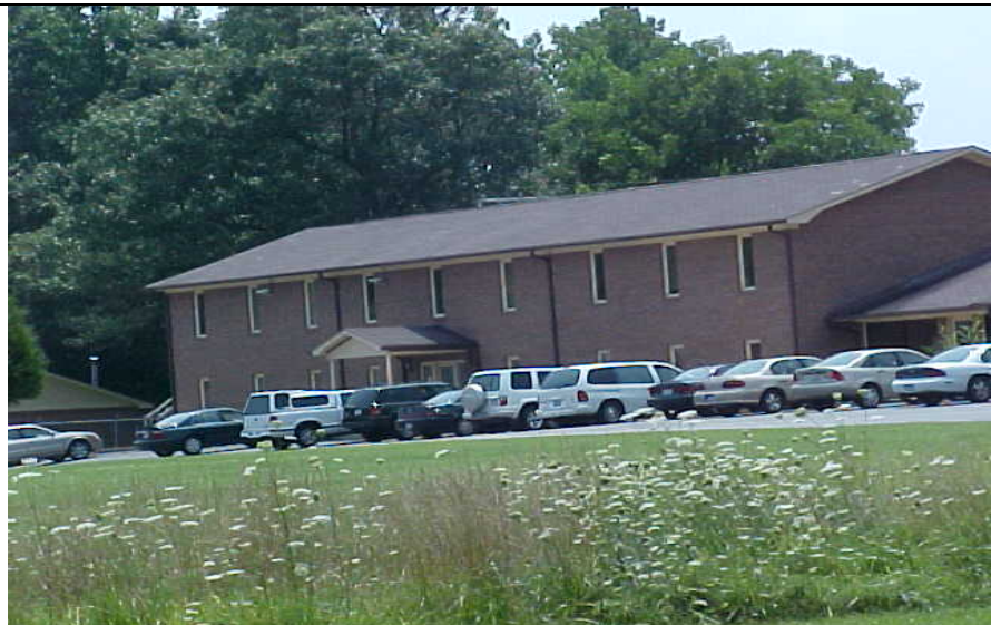
MA 09 OFFICE