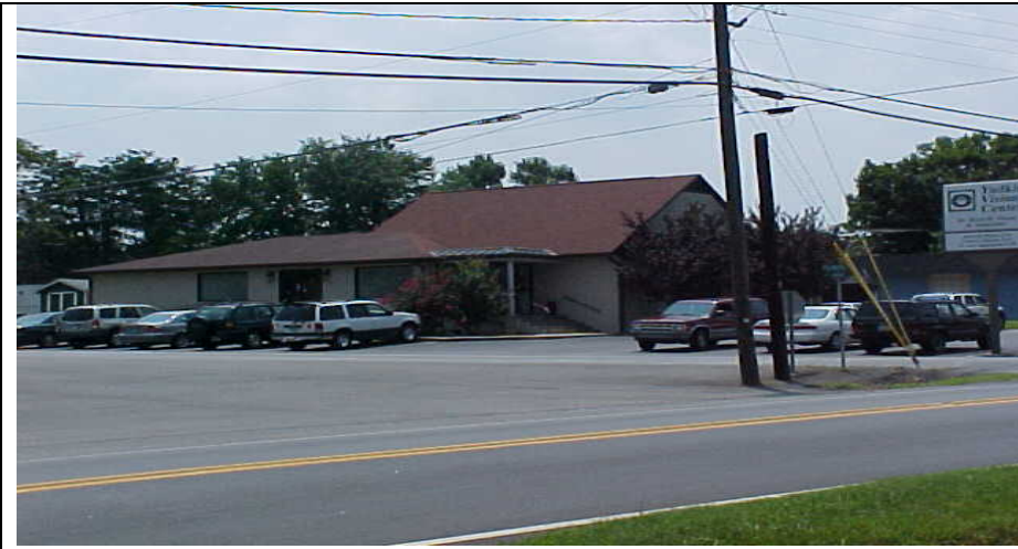
MA 10 MEDICAL OFFICE