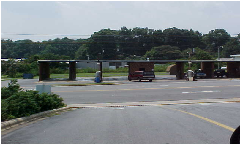
MA 05 CARWASH SELF-SERV