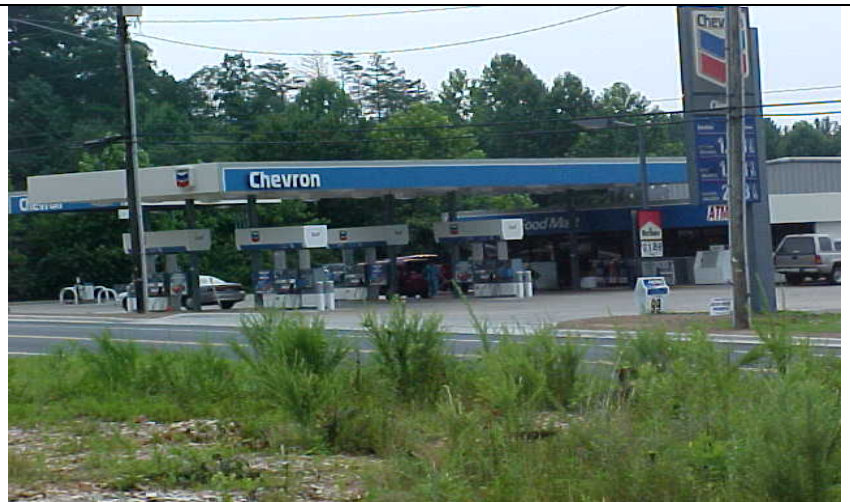
MA 04 CONVEN. STORE