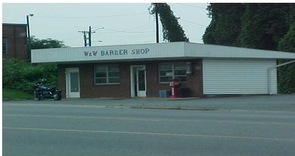
MA 54 BEAUTY BARBER SHOP