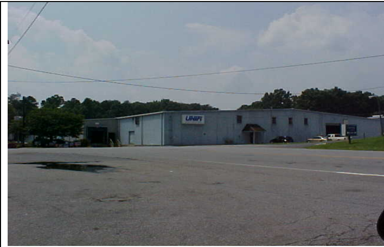
MA 44 WAREHOUSE