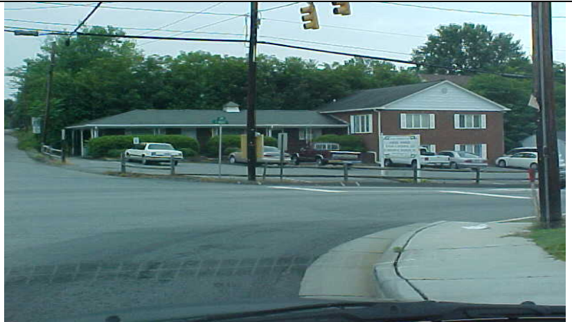
MA 58 CONVERS.