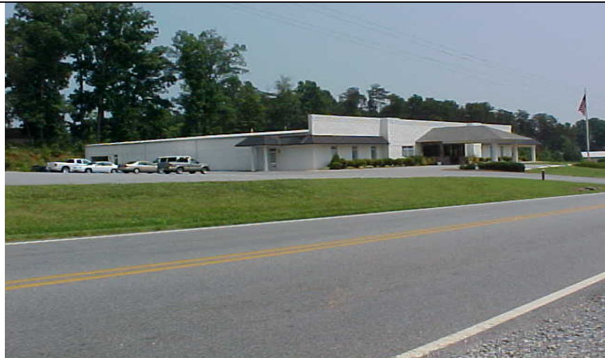
MA 30 FUNERAL HOME